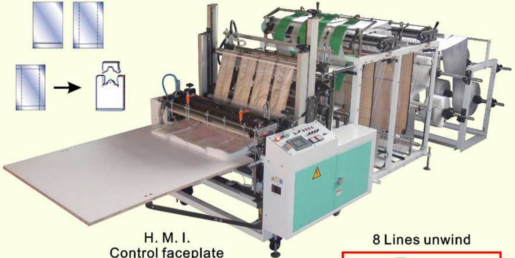
H. M. I. Control faceplate